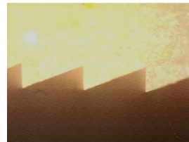
We utilize a number of polymer processing technologies to insure high-fidelity replication.

Reflexite Display Optics is an integrated supplier who provides a system solution from optical design to master tool fabrication to polymer replication and through to finishing. We have a staff of optical engineers who have design expertise in both refractive and diffractive optics. They use some of the latest modeling and testing resources commercially available, as well as some internally developed. We also utilize some of the latest state-of-the-art metrology equipment for verifying our designs and manufacturing processes.